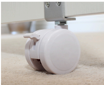
Heavy duty lockable castors