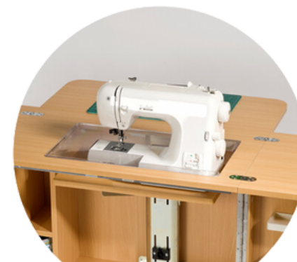
Inset/Insert position (flat-bed)