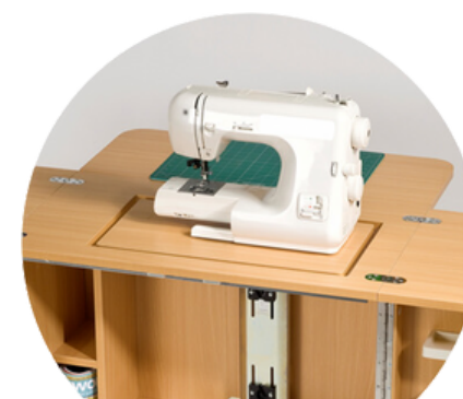
Table-top position (free-arm)