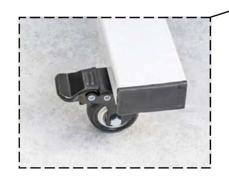
4 large, rubberised, smooth running, lockable castors