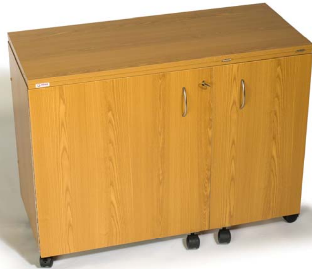
Closed the NOVA is a handsome compact piece of furniture shown here in Medium Oak

With the NOVA you can store both your sewing machine, overlocker and all your vital sewing accessories in one easy to get at location- no problem