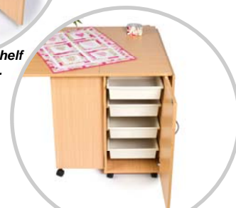
...the other fitted with removable storage baskets.