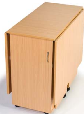
Slim & Mobile when closed