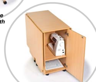
...one side fitted with an adjustable shelf for larger items...