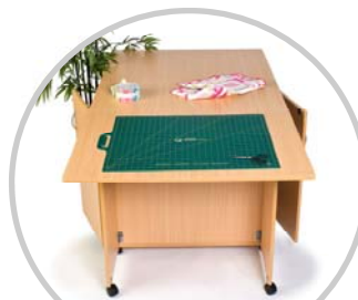
Useful storage cupboards both sides...