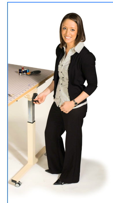
It raises and lowers by the turn of a handle. What could be simpler?

Unrivalled freedom & Comfort. No more kneeling, bending or stooping .....for anyone