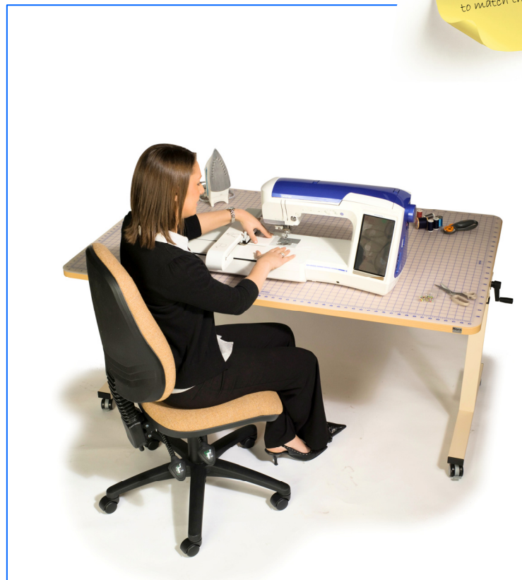
The HILO will easily lower to your sitting height and allows huge leg room

New! Rolla storage drawer unit available to match this model