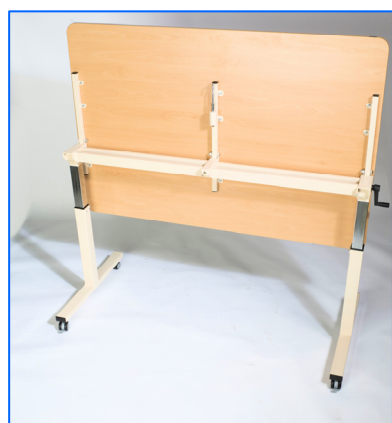
The HILO conveniently folds up out of the way when not in use