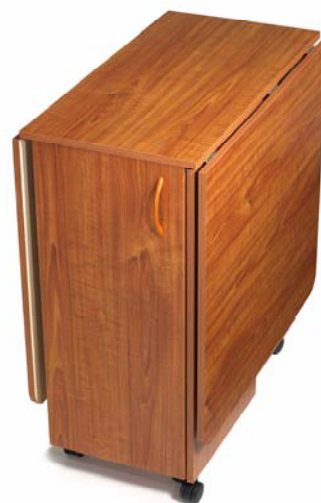
Slim & Mobile when closed