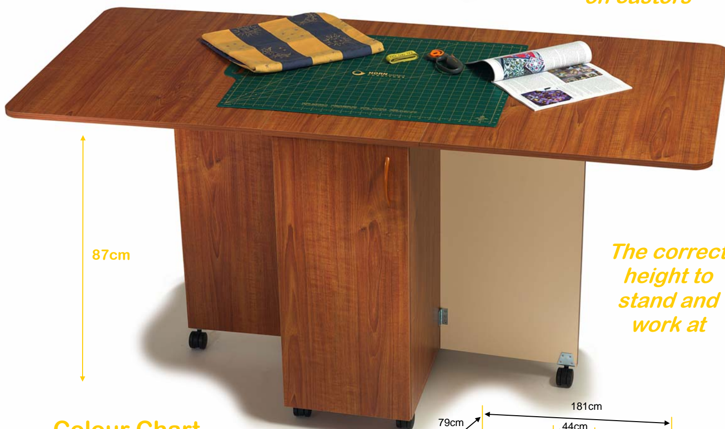
The correct height to stand and work at